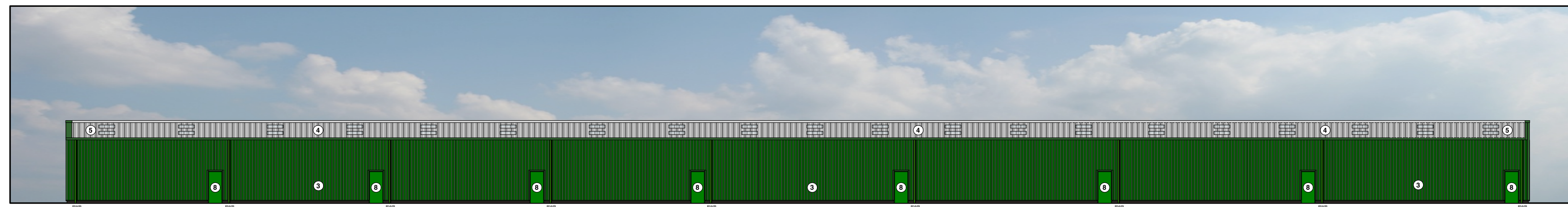
EASTERN ELEVATION 1:200