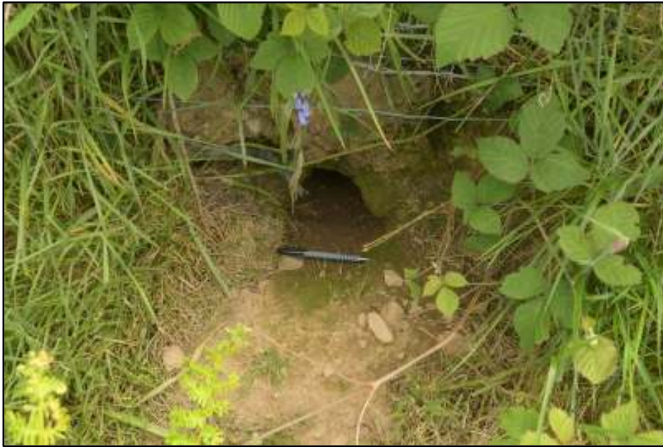
Looking east far corner of the field