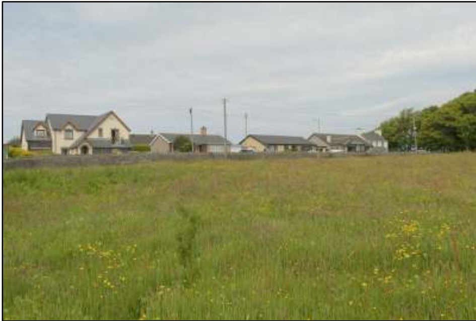
Looking north-east towards Llain Rallt