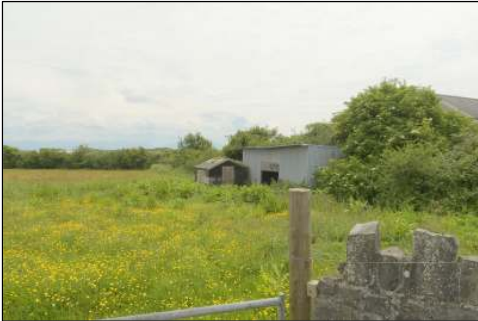
Looking east from the entrance