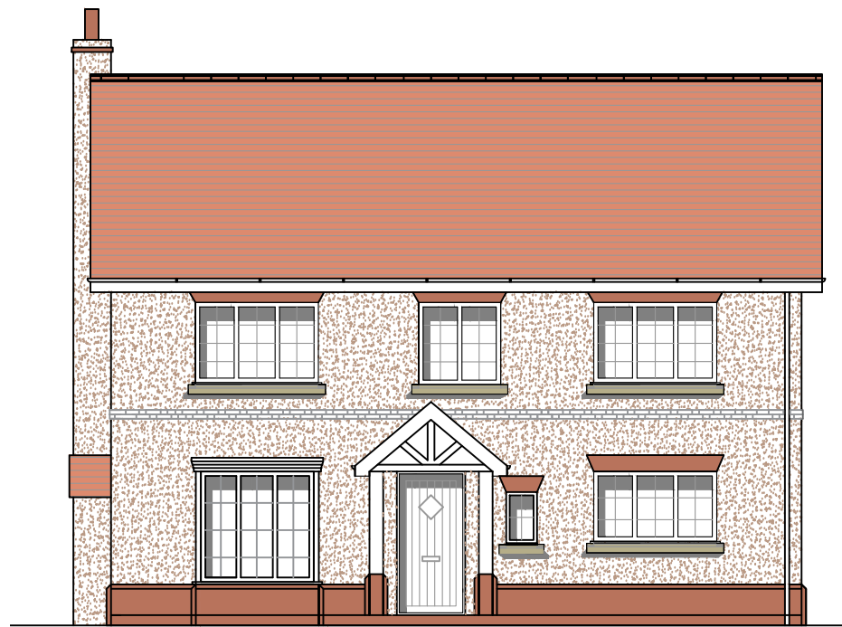
1 The Westbury V2 Front Elevation A 1:100