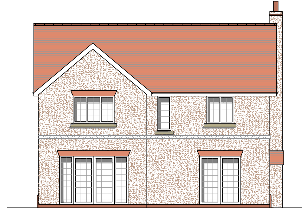
2 The Westbury V2 Rear Elevation B 1:100