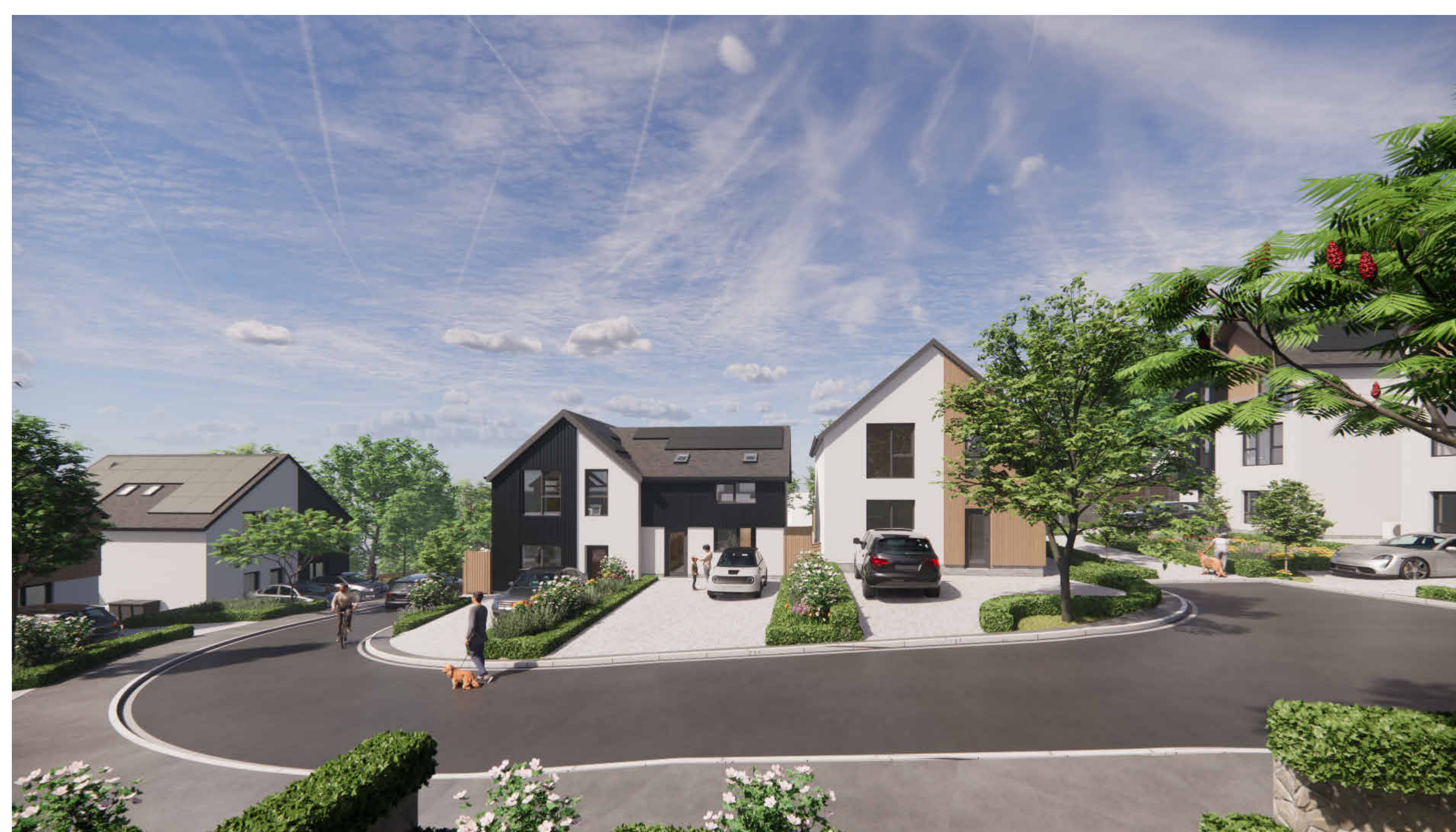
3D VIEW 6