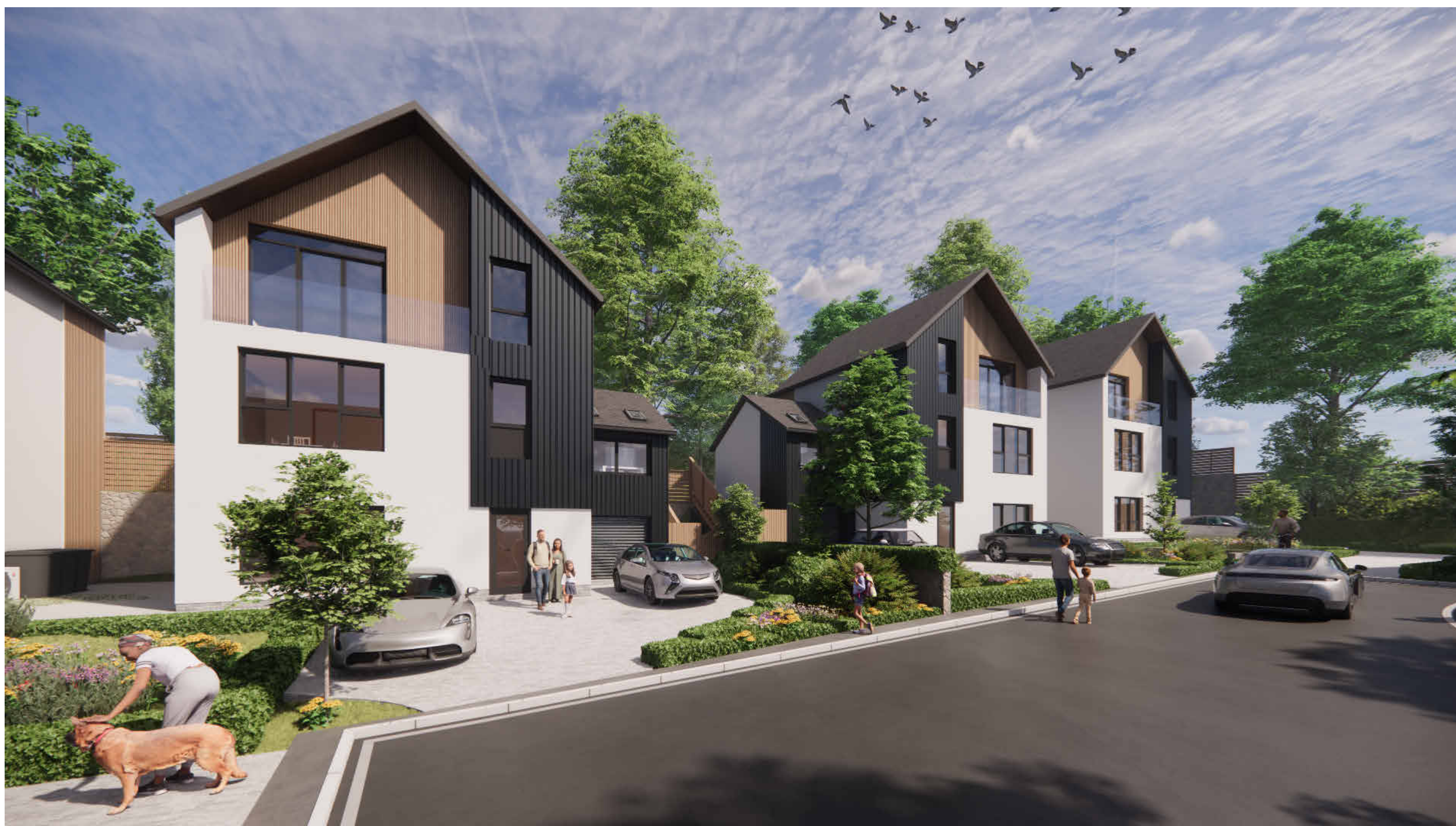
3D VIEW 4