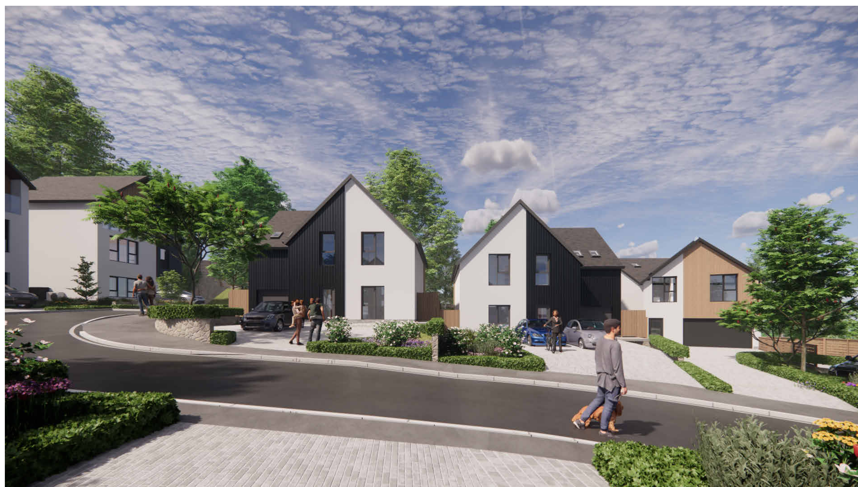
3D VIEW 5