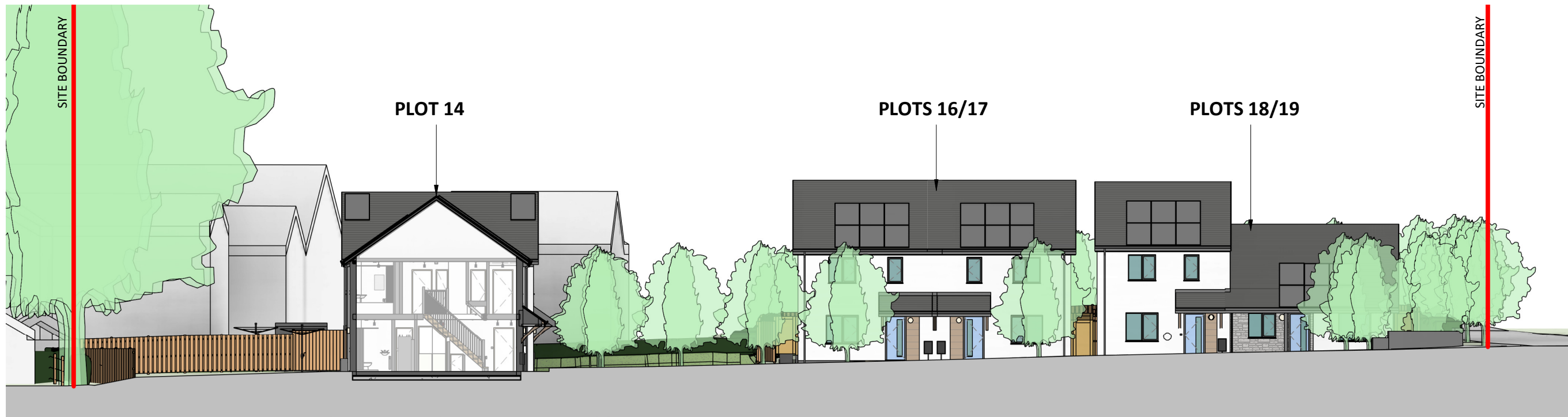
3 | STREET ELEVATION FACING EAST THROUGH SITE ENTRANCE SCALE: 1 : 200