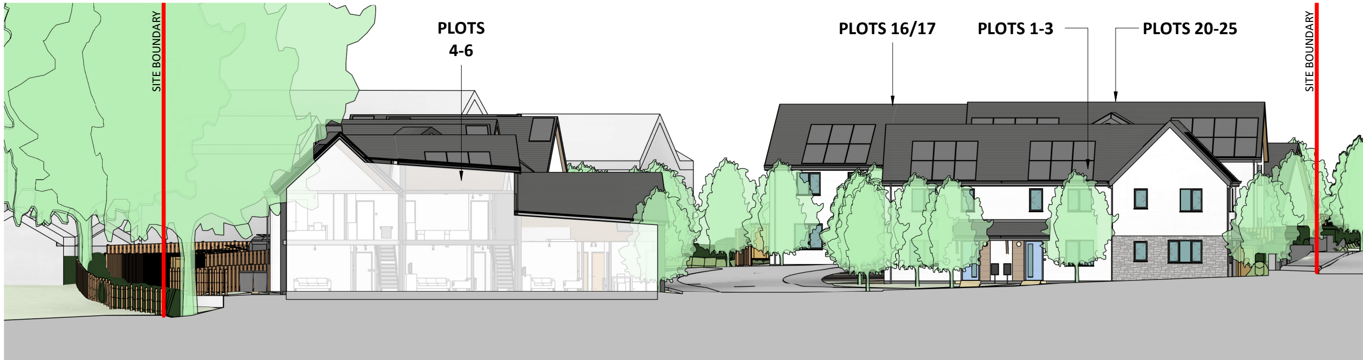
4 | STREET ELEVATION FACING EAST SCALE: 1 : 200