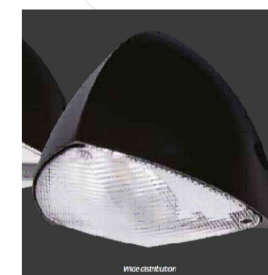
Type EX2 Luminaire (Building Mounted) Thorux Realta High Performance Luminaire designed to minimise light pollution and energy consumption All Building Mounted Luminaires to be complete with integral smart controls carrying out the following functions:-