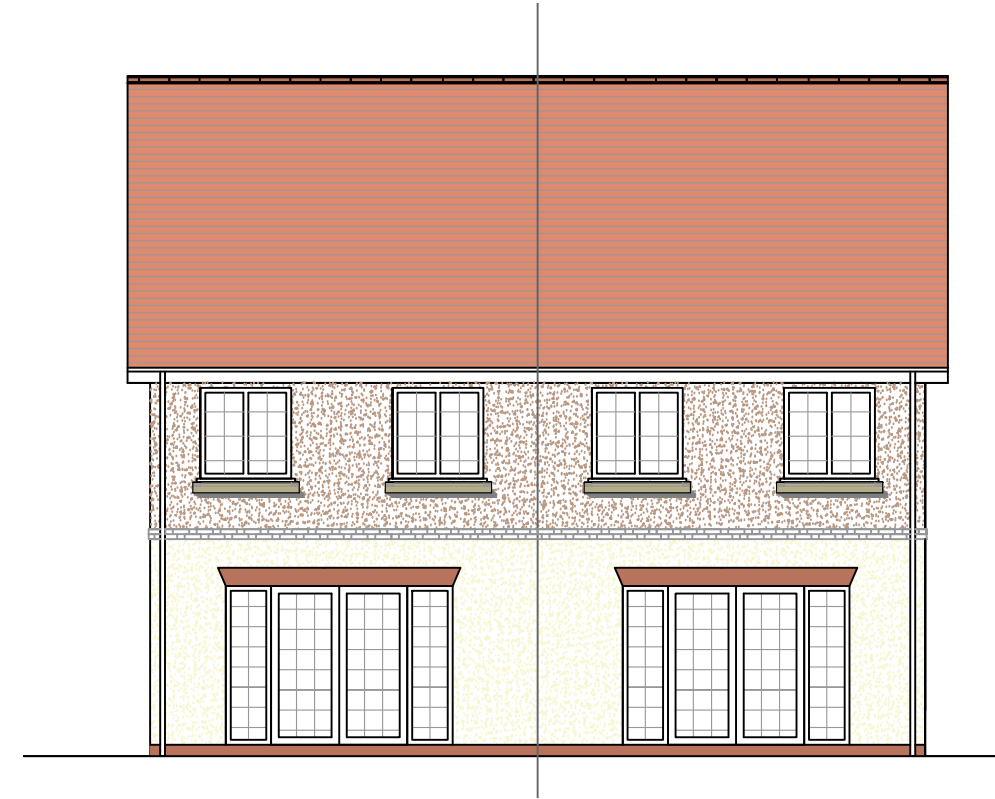
2 The AF1 & AF2 Rear Elevation B 1:100