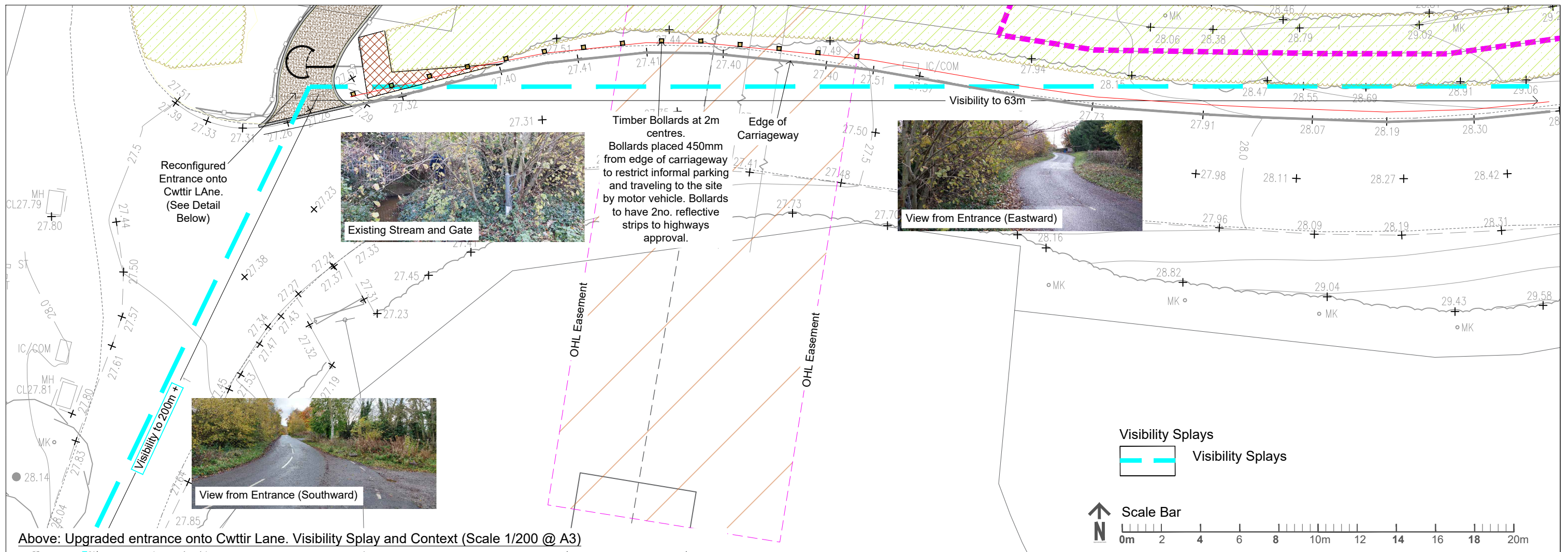
Above: Upgraded entrance onto Cwttir Lane. Visibility Splay and Context (Scale 1/200 @ A3)