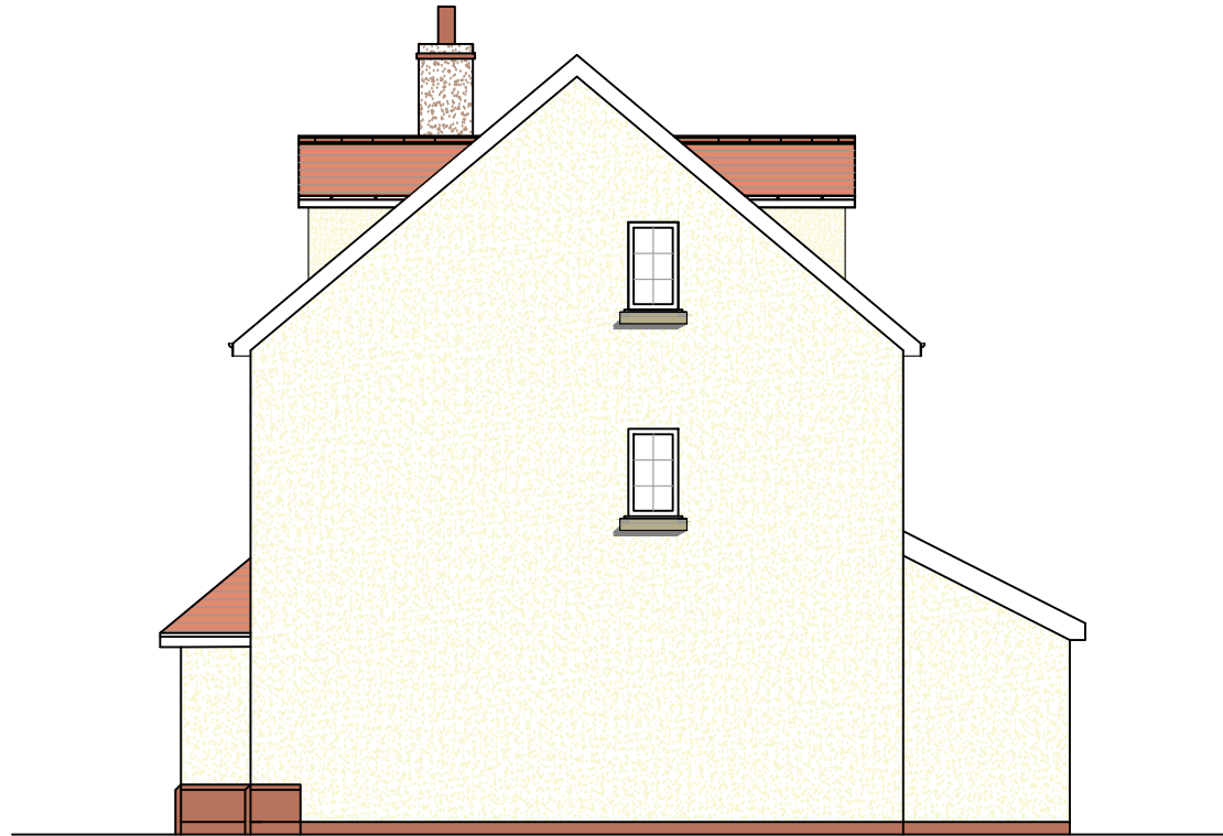
3 The Hathaway Side Elevation C 1:100