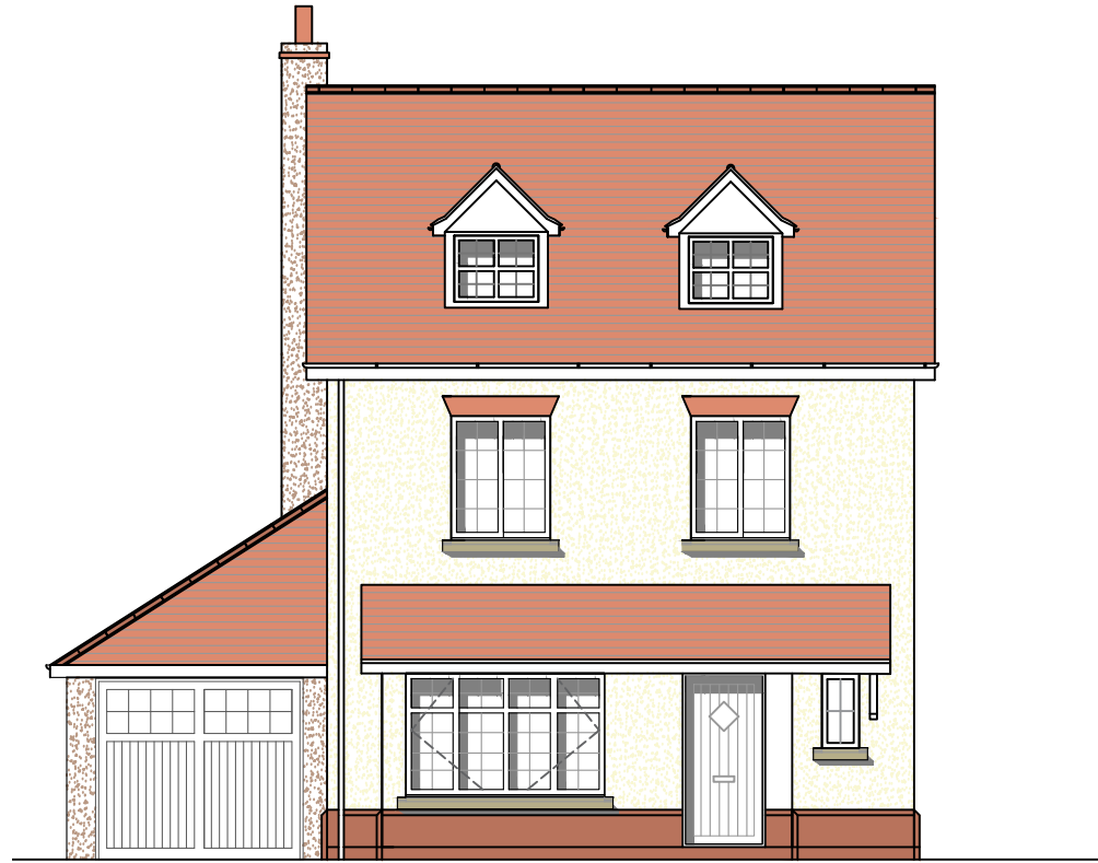
1 The Hathaway Front Elevation A 1:100