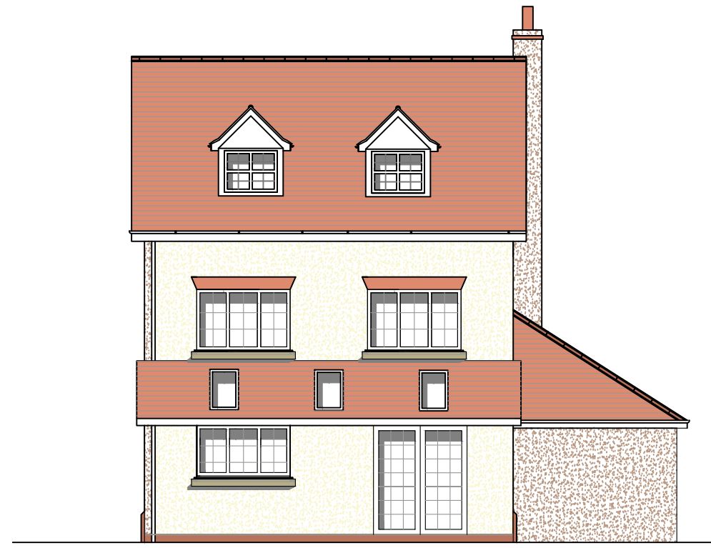
2 The Hathaway Rear Elevation B 1:100