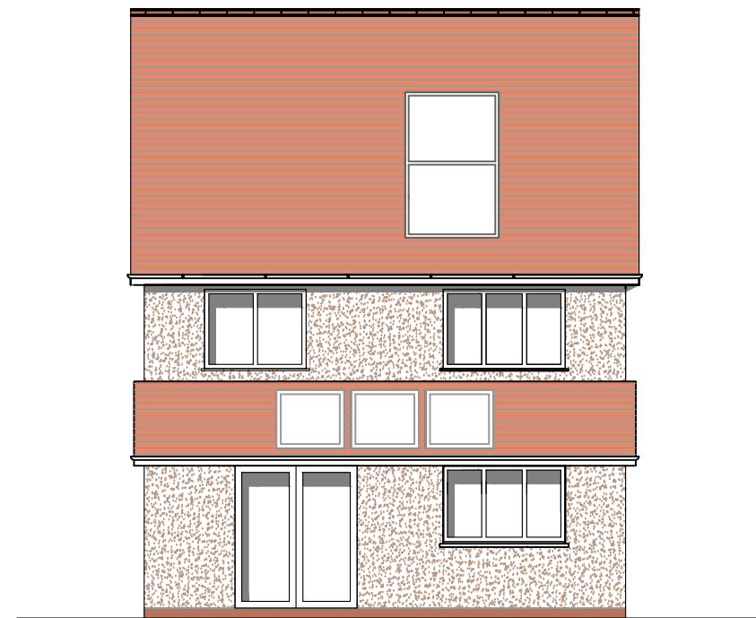
2 The Oakwood Rear Elevation B 1:100