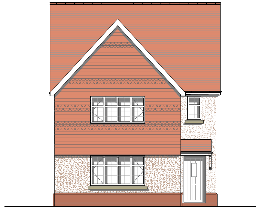
1 The Oakwood Front Elevation A 1:100