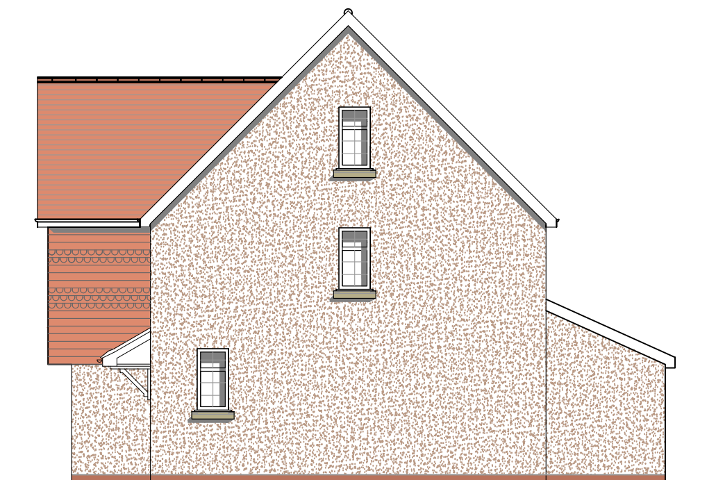
3 The Oakwood Side Elevation C 1:100