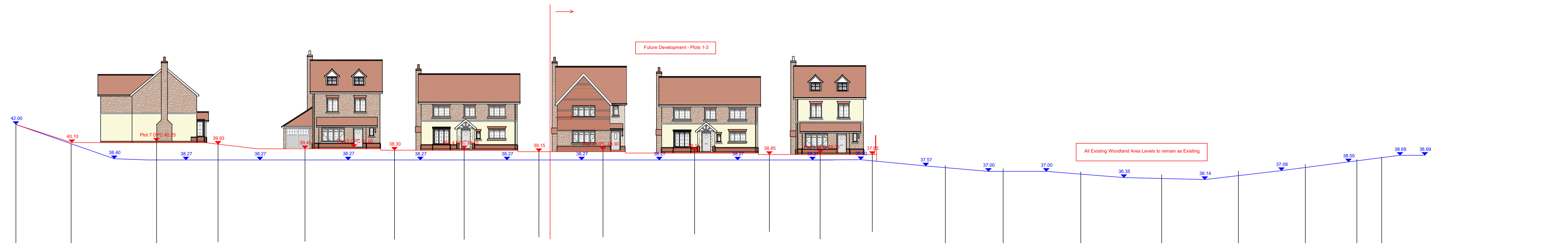
Proposed Section B