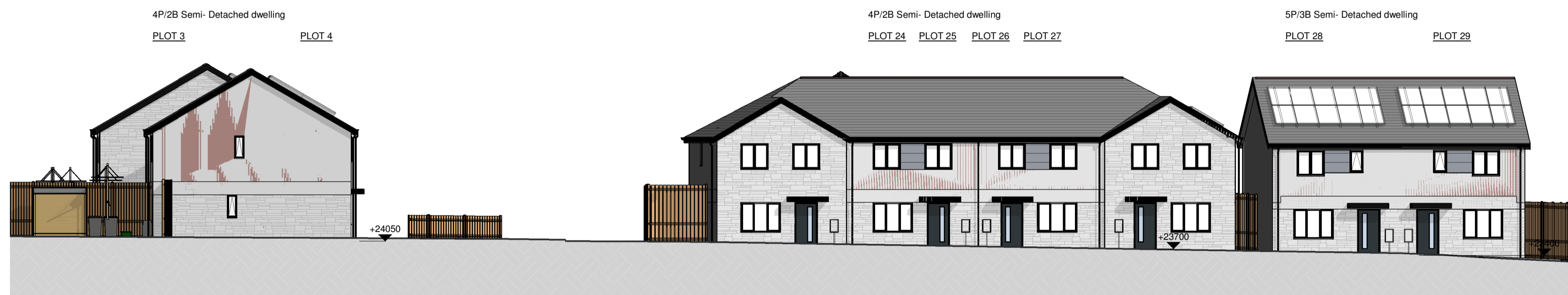
4 Site Section_03 Scale: 1 : 150