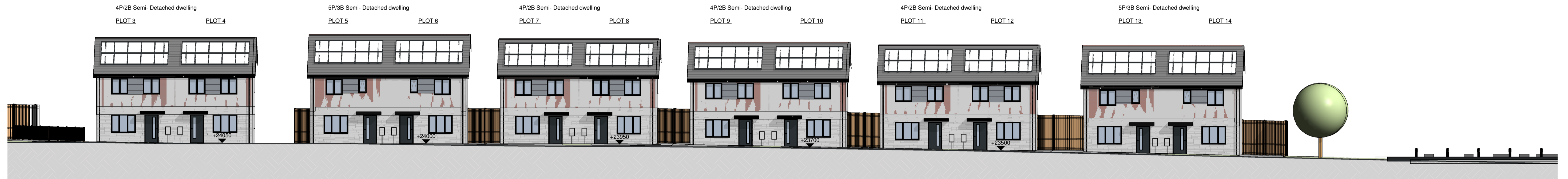
2 Site Section_01 Scale: 1 : 150

This drawing is copyright and to be returned to the architect on completion of the contract.