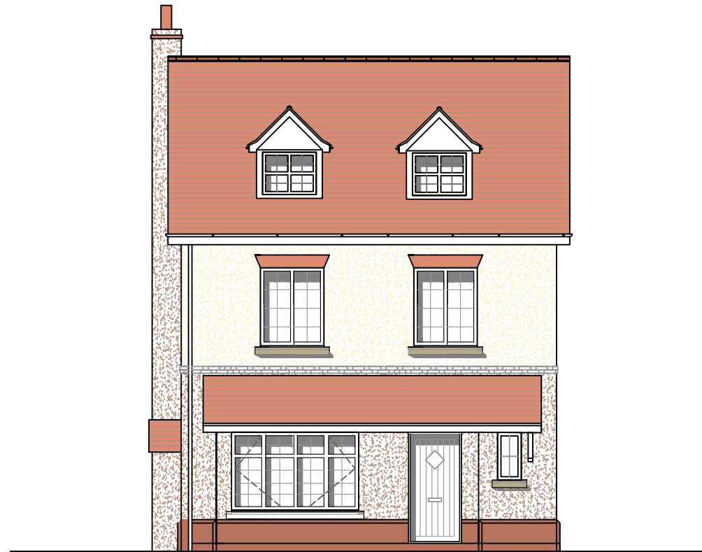
1 The Cherrington V1 Front Elevation A 1:100