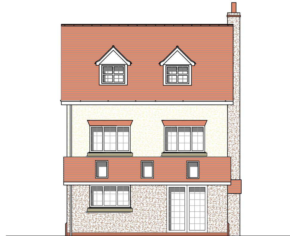
2 The Cherrington V1 Rear Elevation B 1:100