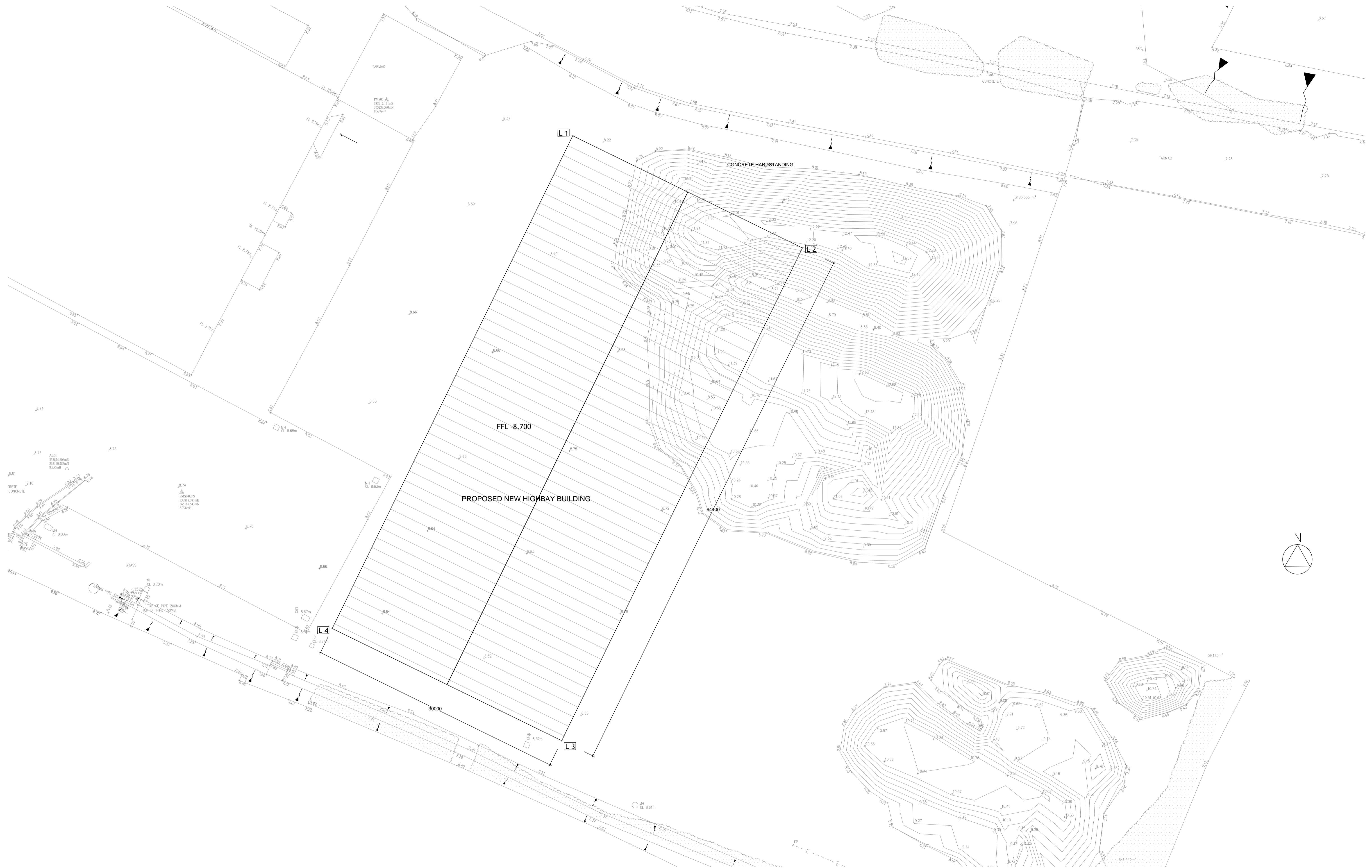
PROPOSED SITE PLAN scale 1:200