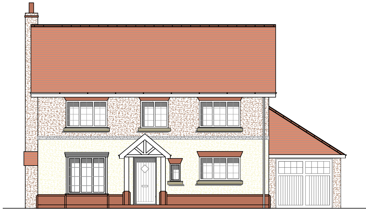
1 The Westbury V1 Front Elevation A 1:100