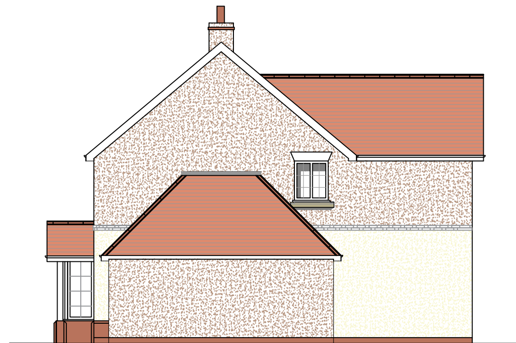
4 The Westbury V1 Side Elevation D 1:100