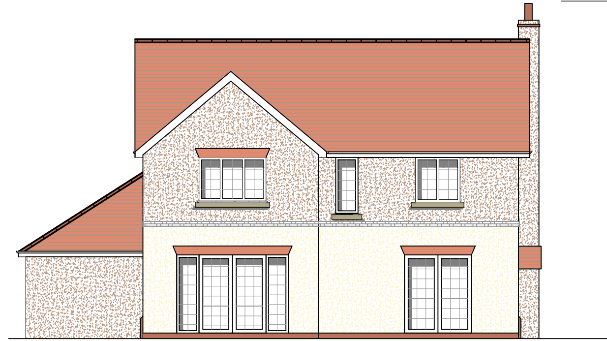
2 The Westbury V1 Rear Elevation B 1:100