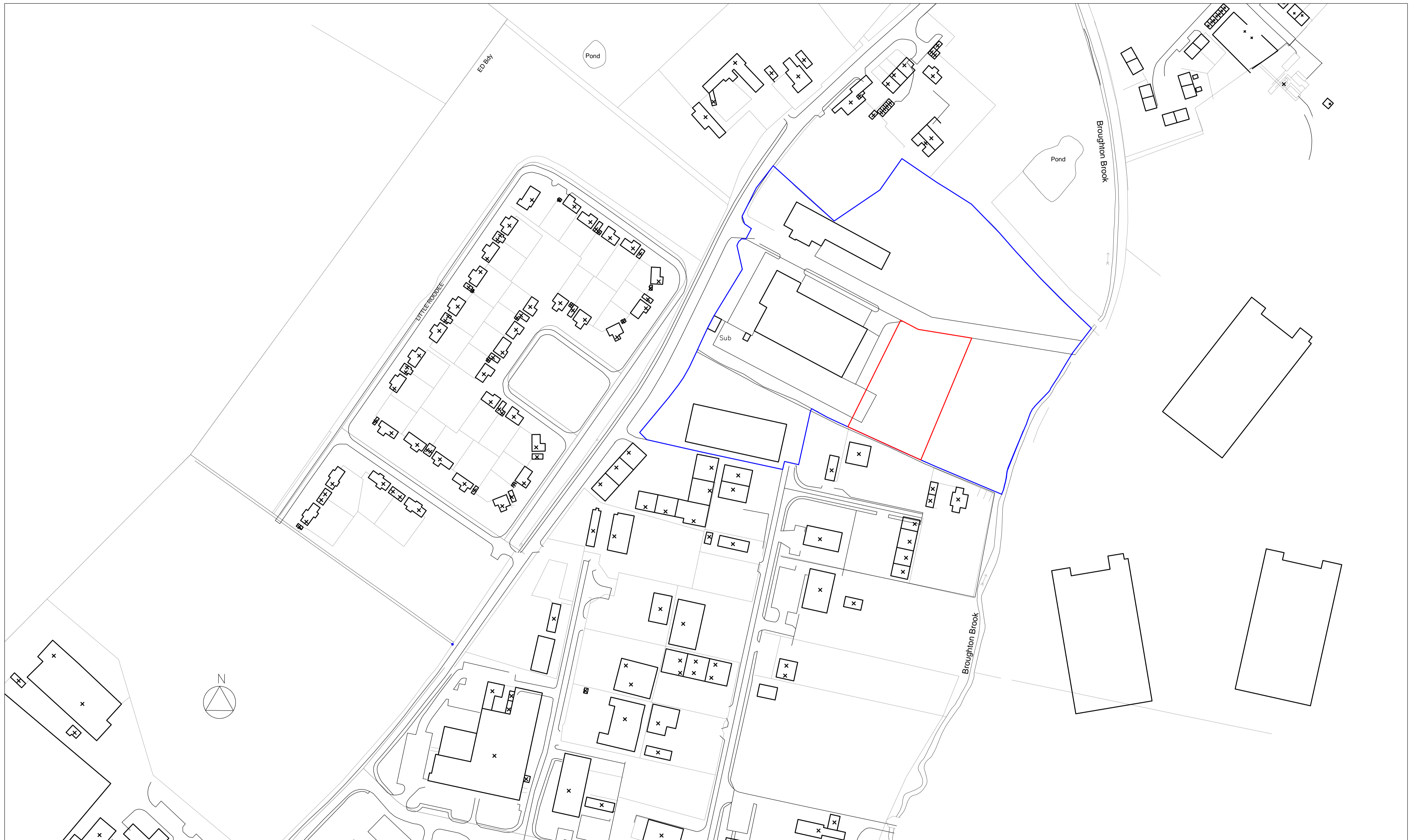
SITE LOCATION PLAN scale 1:1250