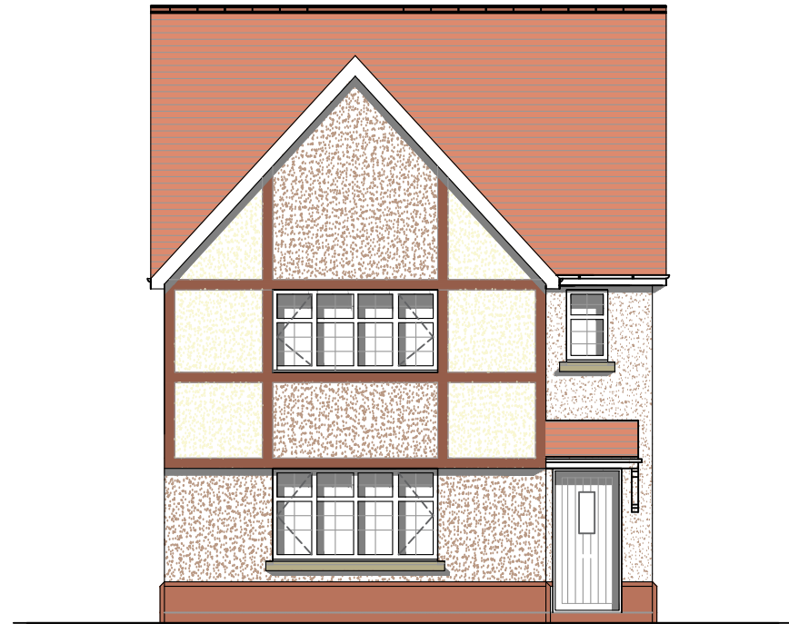
1 The Tudor Front Elevation A 1:100