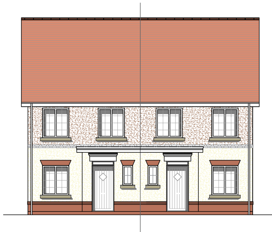
1 The AF1 & AF2 Front Elevation A 1:100