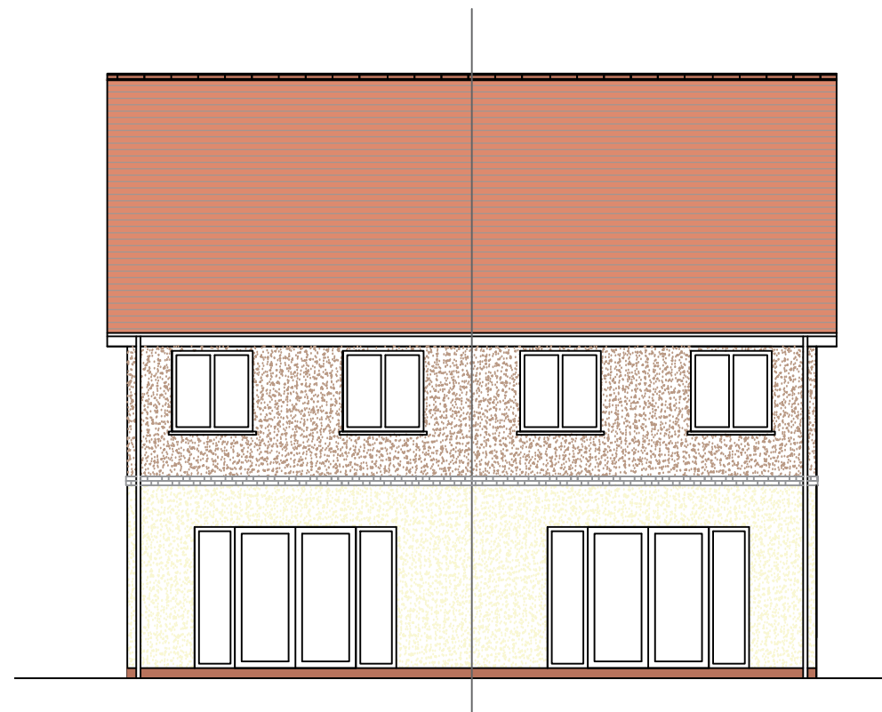
2 The AF1 & AF2 Rear Elevation B 1:100