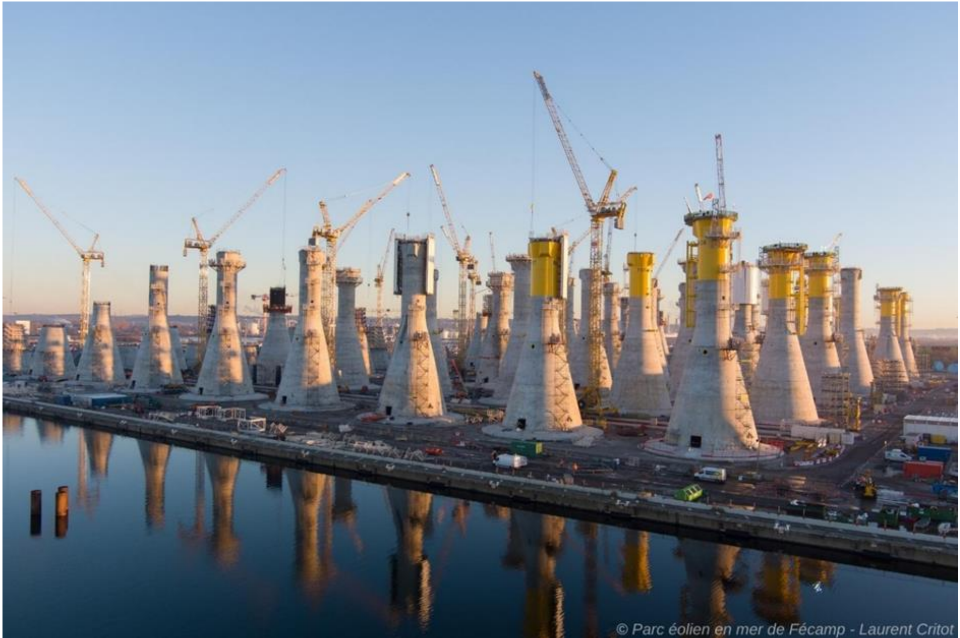
Example of previous GBS Construction